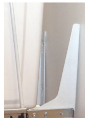
Door Mount Kit for TC35-S TC-35D